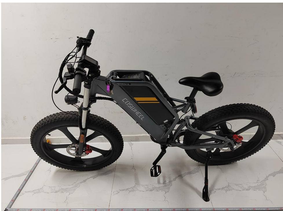
Photo 4 - External View_4