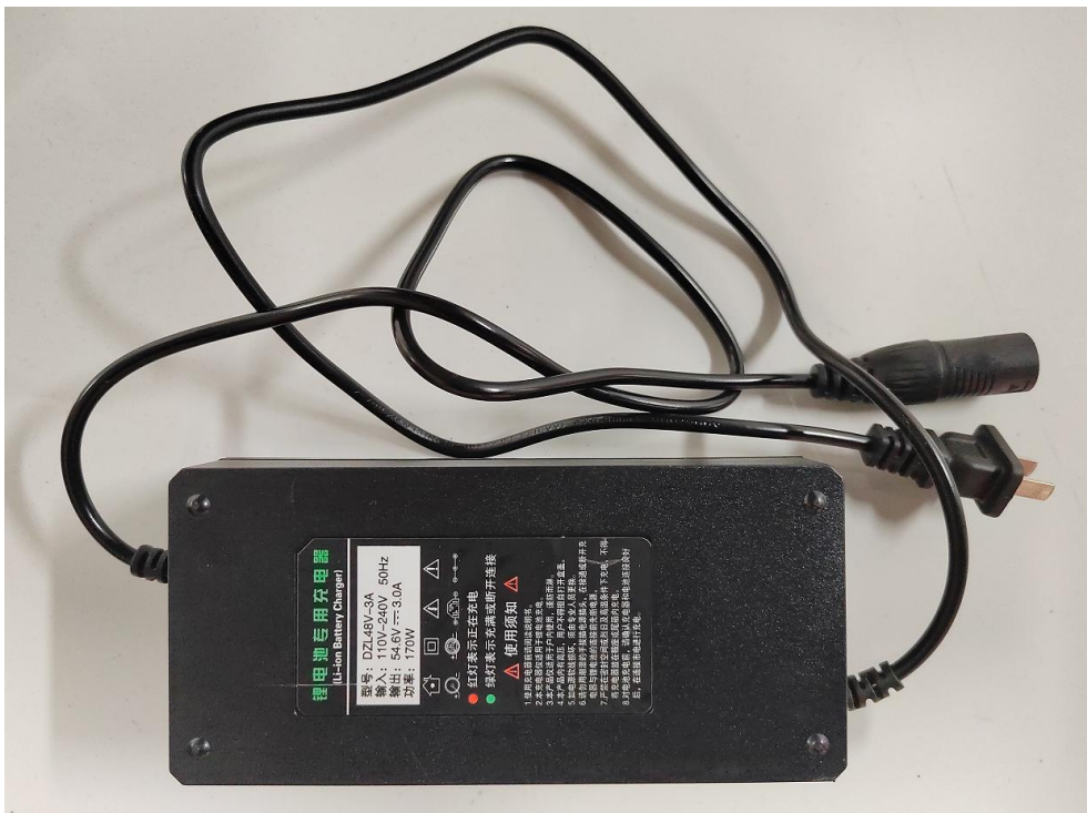
Photo 10 - Battery charger View_2