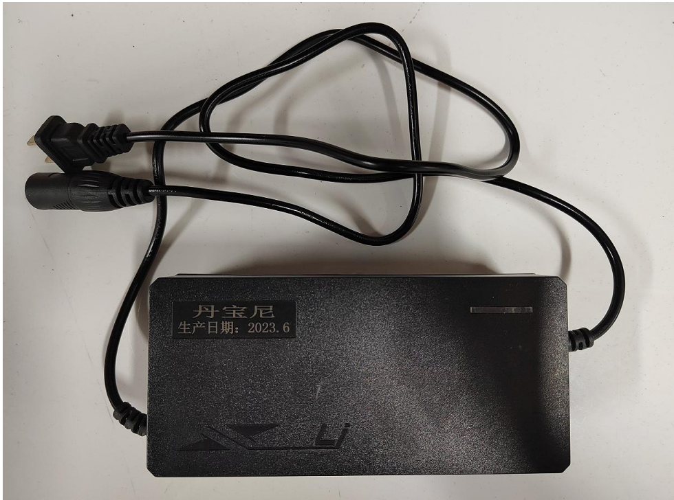
Photo 9 - Battery charger View_1