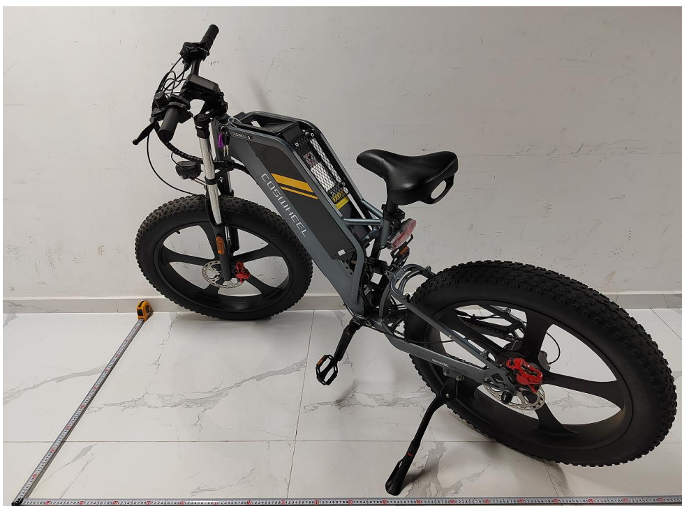
Photo 2 - External View_2