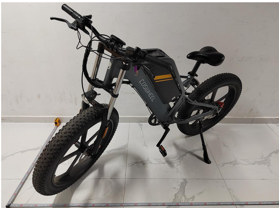
Photo 3 - External View_3