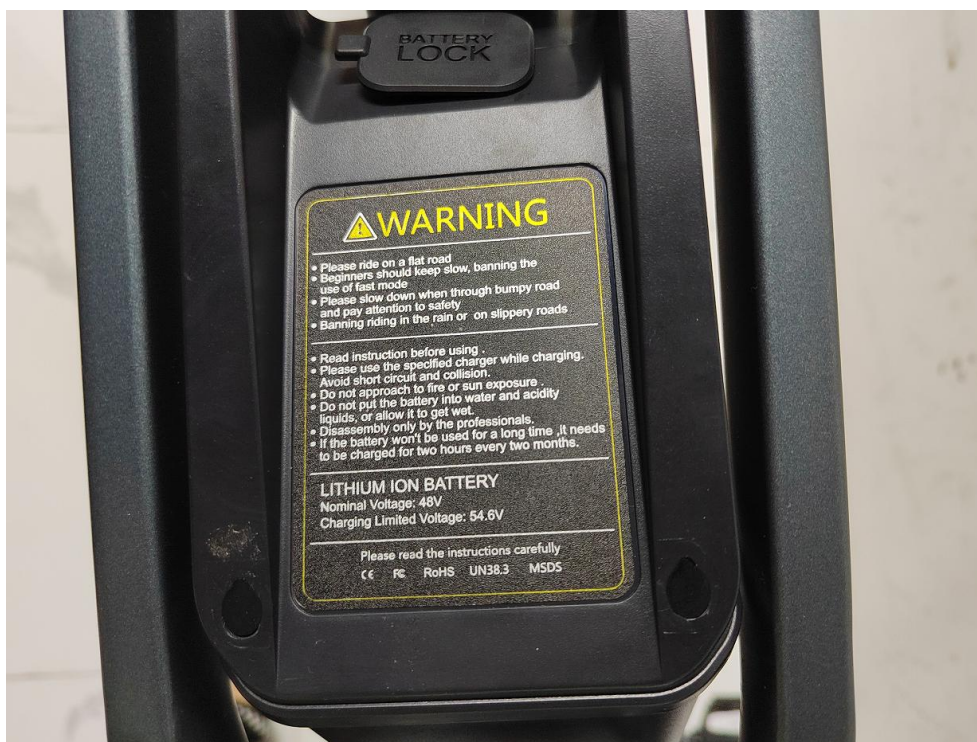
Photo 8 - Battery View_1